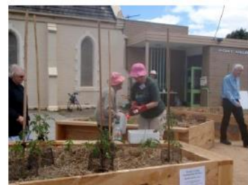
November 2008 – garden working bee

For more information on the Five Leaf Eco-Awards contact fiveleafecoawards@gmail.com