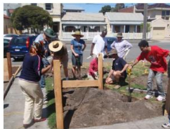
October 2008 – building the garden