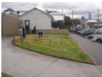
August 2008 -laying out the garden plan

The Simply Living Community Garden grew out of the Eco project. The garden was funded by a Community Grant from the City of Port Phillip and built in a series of community working bees during October 2008. The garden design and supervision of the working bees was provided by the gardening team at the Port Phillip EcoCentre. Thirty nine people participated in the working bees to help build the garden and others have since come along to help work in the garden.